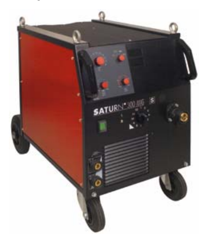
gas cooled, compact