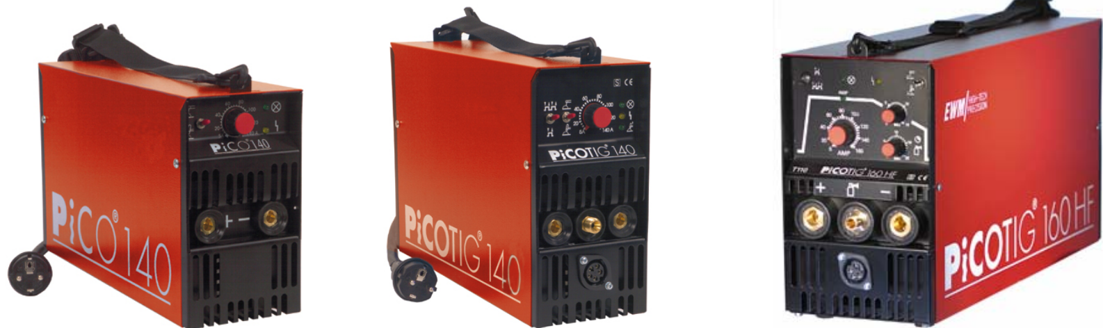
The portable PICO series from 140A-160A