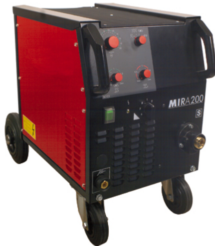
MIRA: 200A-250A, gas cooled, compact