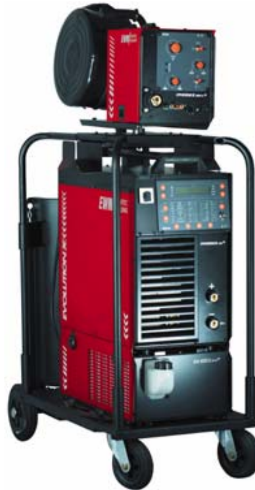
PHOENIX 420, 500

Jl. Pulo Ayang Kav R1. Kawasan Industri Pulogadung- Jakarta, Tel.+62.21.4602594