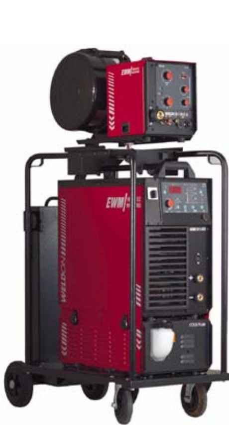
SIRION 420, 500