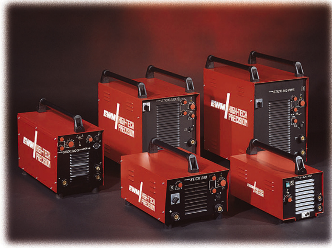
The portable Stick Series from 200A-450A