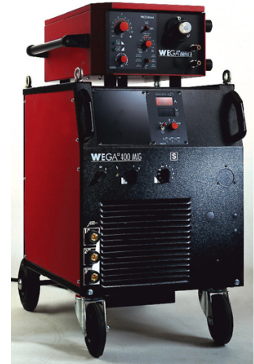
WEGA: 330A-600A, gas and water cooled, compact or with separate wire feed unit