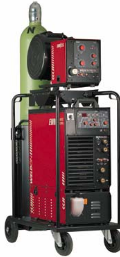
TRITON 420, 500