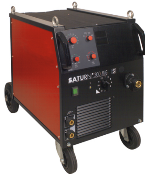
SATURN: 250A-300A, gas cooled, compact